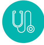
About Your Doctors