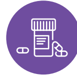
About Your Prescriptions